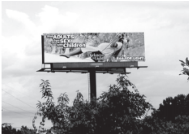
Billboard on I-26 West, near Monague Ave. exit

The TV schedule features "School", a :30 commercial that exposes the fact that 72% of school shootings that happened in the last two years were committed by children who were abused at a young age. A corresponding radio commercial is being aired on WCOO ("Cool 105.3") and WYBB ("98 Rock"), at no charge. Local billboard